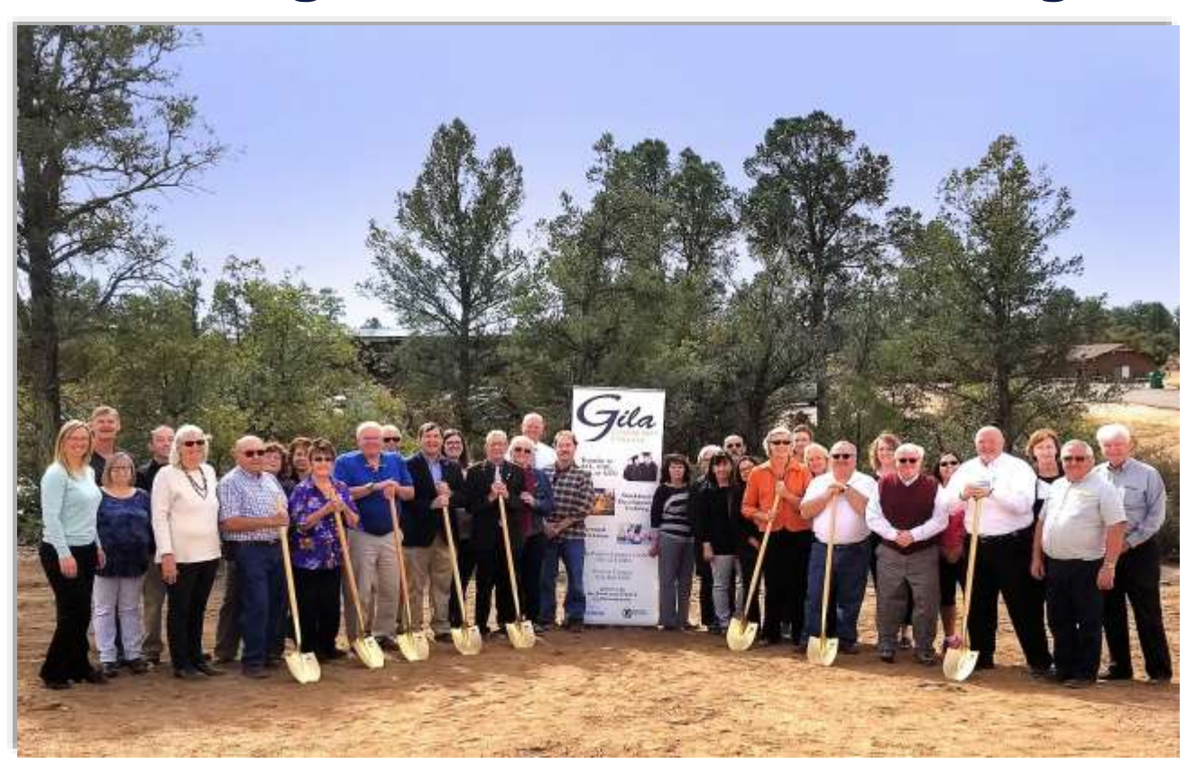
In October, GCC broke ground for it's new nursing skills building. Officials from the GCC board, Town of Payson, and Gila County gathered in support of this new addition to the Payson Campus.